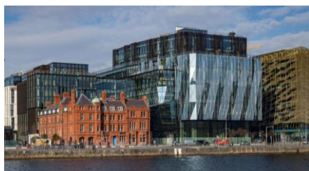
Adare Office Asset – Dublin, Ireland