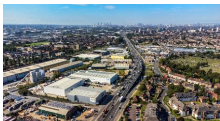
Mileway – Pan-European

Your capital is at risk and you may lose some or all of your investment. There can be no assurance that the Fund will achieve its objectives, pursue any particular theme or avoid substantial losses. Past performance does not predict future returns. The figures herein include preliminary, unaudited results, which are subject to further review and adjustment. The use of leverage or borrowings magnifies investment, market, and certain other risks and may have a significant impact on returns, resulting in the partial or total loss of capital invested. The unit redemption program is subject to certain limitations (including the 2% of NAV monthly redemption limit and the 5% of NAV quarterly redemption limit) and Blackstone Bepimmo may make exceptions to modify, suspend or terminate the program.