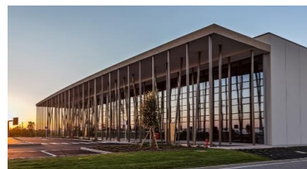
Luna Logistics Portfolio – Italy

Note: When used in this document and unless otherwise specified or unless the context otherwise requires, references to the "Fund" should be read as references to Blackstone European Property Income Fund SICAV, Blackstone European Property Income Fund (Master) FCP and their parallel entities, such as Blackstone European Property Income Fund S.L.P. ("Blackstone Bepimmo"). Investor eligibility requirements and minimum subscription amounts apply.